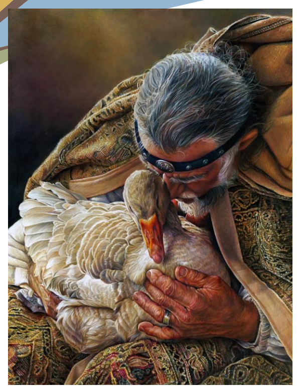
Father Goose, 19x25, colored pencil on toned paper