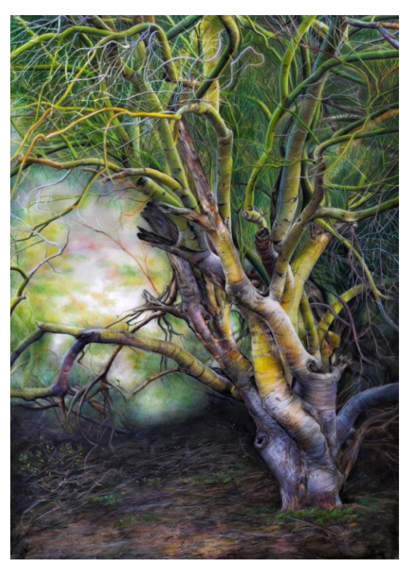
Beyond the Green Line, 19×30, colored pencil on drafting film