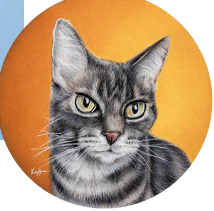
Lola, 6x6, Colored Pencil on Pastelmat