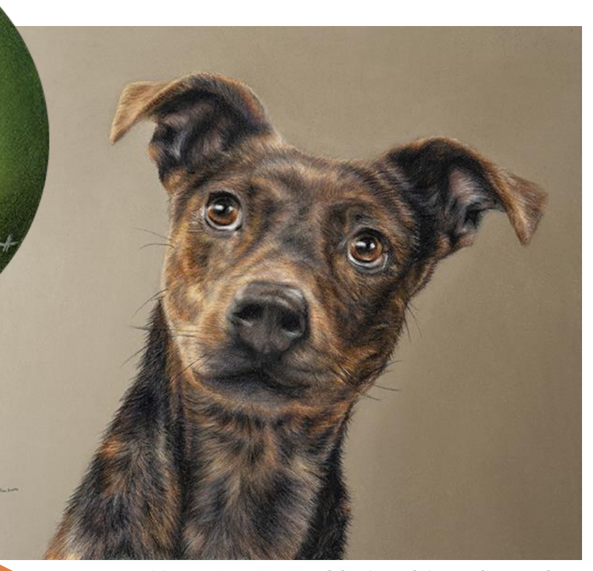
Treats?! (Louis), 9x12, Colored Pencil & Pastel on Pastelmat