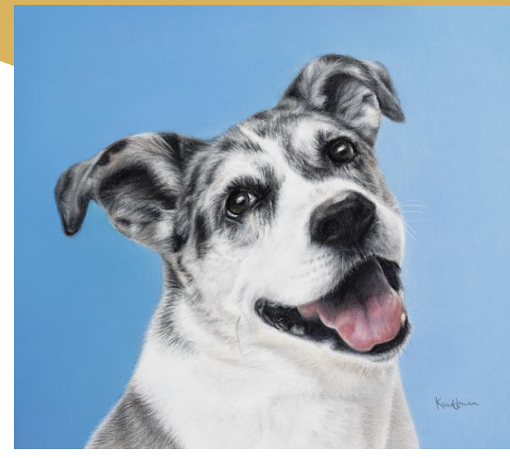
MI, 9x12, Colored Pencil & Pastel on Pastelmat