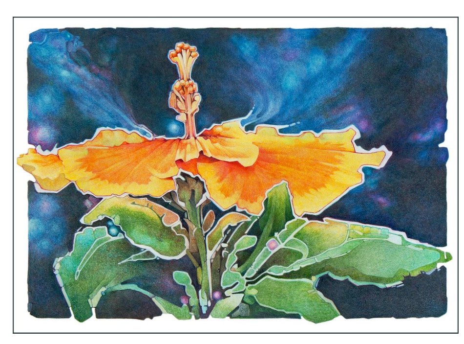
Flourish, 15x21 inches, colored pencil on paper