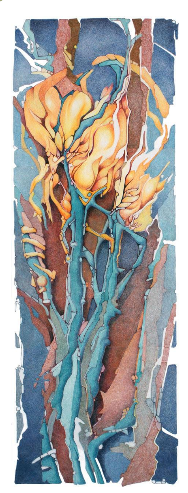
New Pathways, 26x10 inches, colored pencil on paper