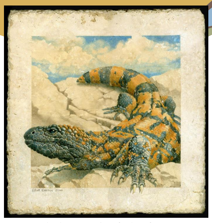
Desert Beadwork, 16x16 inches, colored pencil on stone