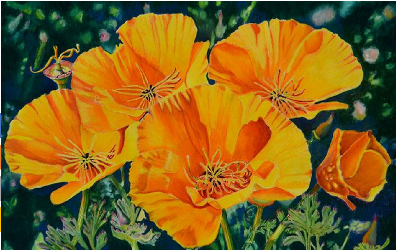
Sun Salutation, 10 × 16, colored pencil on paper