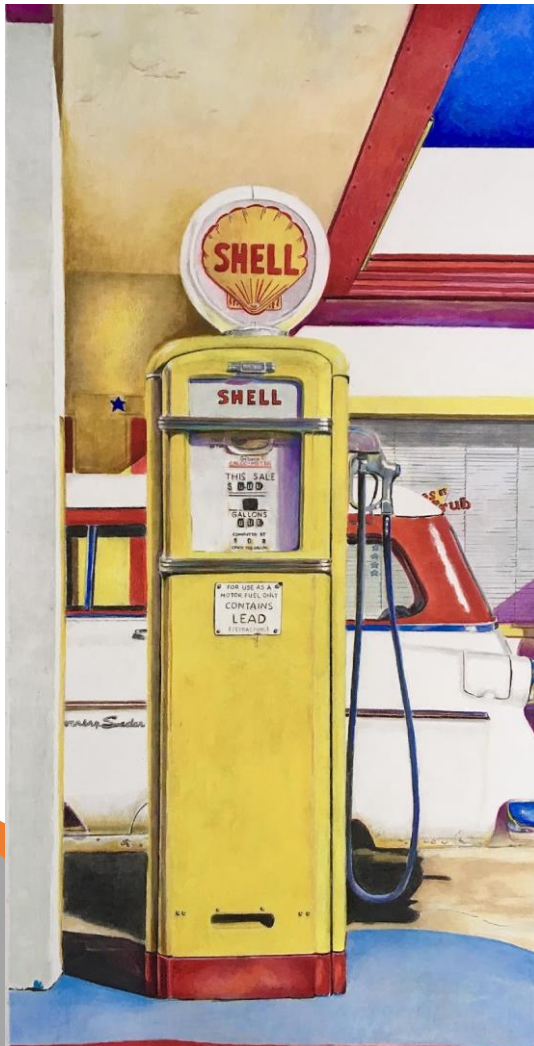
Retro Gas, colored pencil