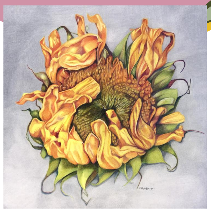
Resilience, 13×13 inches, colored pencil on paper