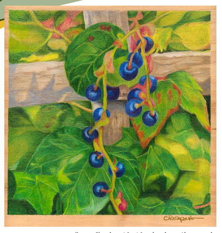
Secret Garden, 13x13 colored pencil on wood