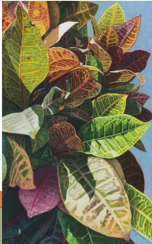
Crotons in Puerto Vallarta, 20x12.5, colored pencil