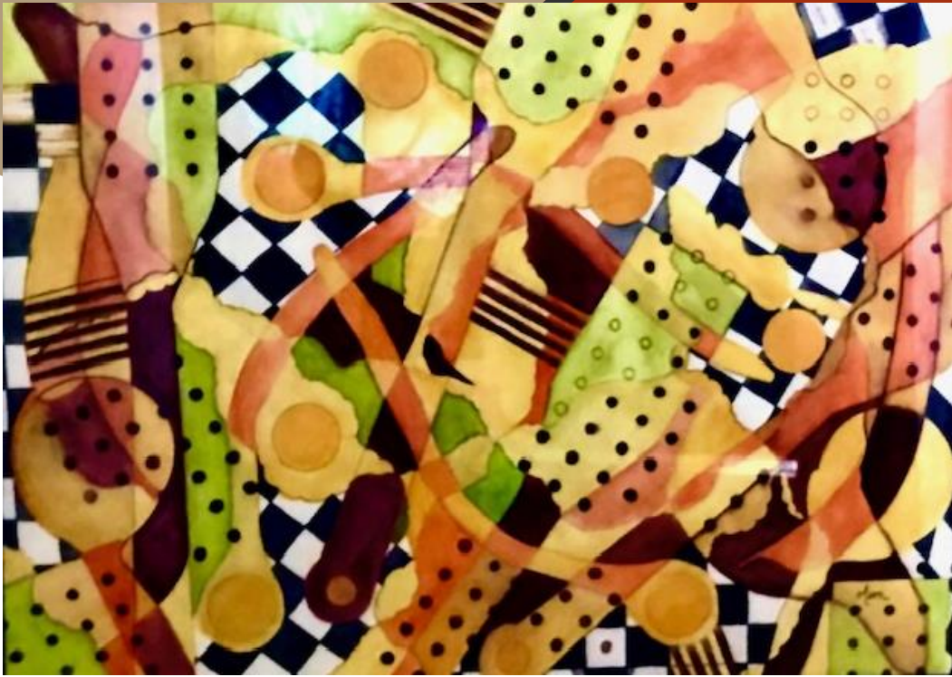
Eggs and Bacon, 17x23, watercolor pencil on paper