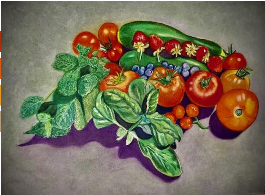
Backyard Bounty, 8x10.75 inches, colored pencil on paper