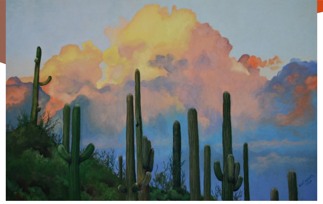
Monsoon Sky, 13" X 19", Colored Pencil w/Solvent on UArt 500 grit