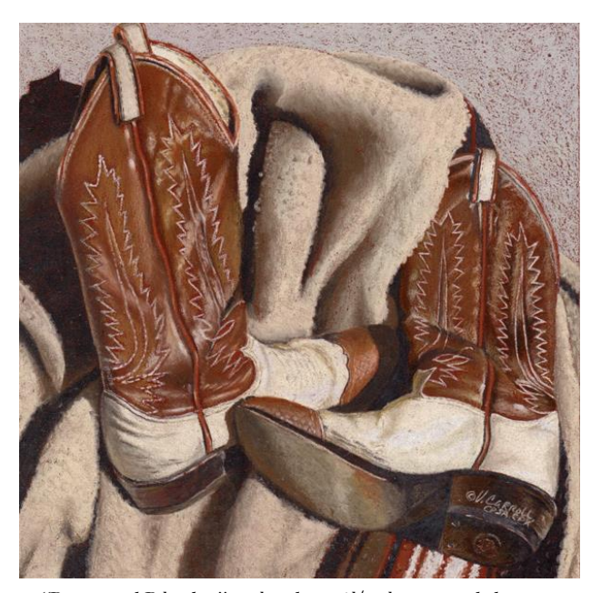
"Boots and Blanket", colored pencil/solvent, sanded paper