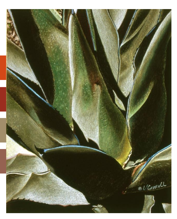
Agave No 2, 10" X 8", 100% Colored Pencil on UArt 500 grit