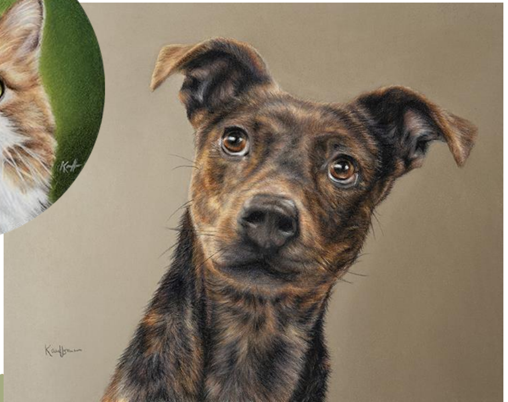
Treats?! (Louis), 9x12, Colored Pencil & Pastel on Pastelmat