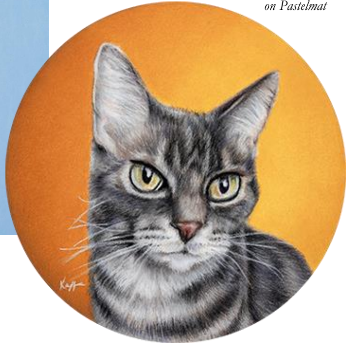
Lola, 6x6, Colored Pencil on Pastelmat