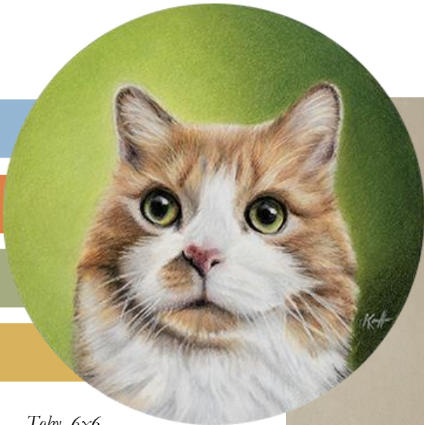
Toby, 6x6, Colored Pencil on Pastelmat