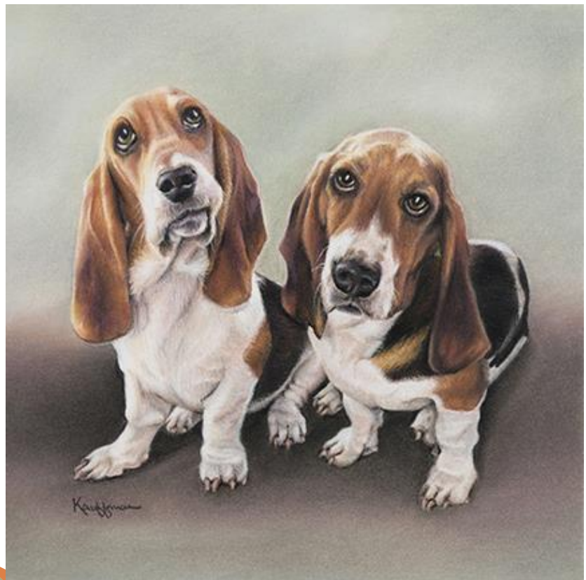
Copper & Bisbee, 10x10, Colored Pencil on Pastelmat