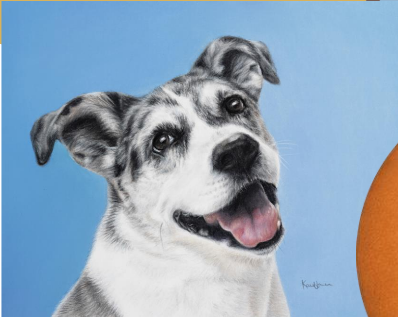
MI, 9x12, Colored Pencil & Pastel on Pastelmat