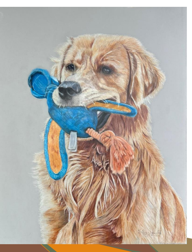
Sonny, 11x14 inches, colored pencil on drafting film