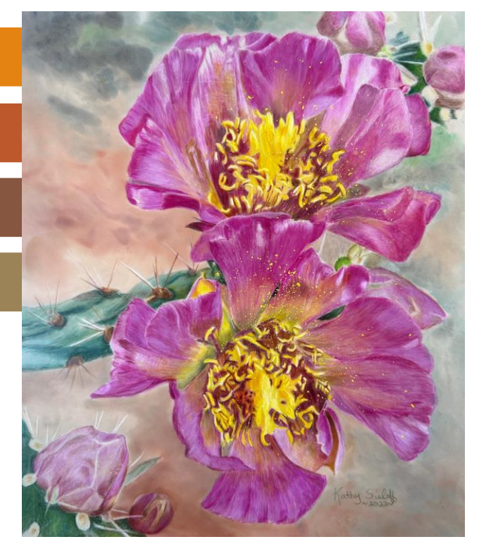
Pretty in Pink, 8x10 inches, colored pencil on drafting film