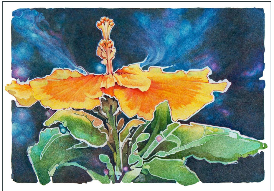
Flourish, 15x21 inches, colored pencil on paper