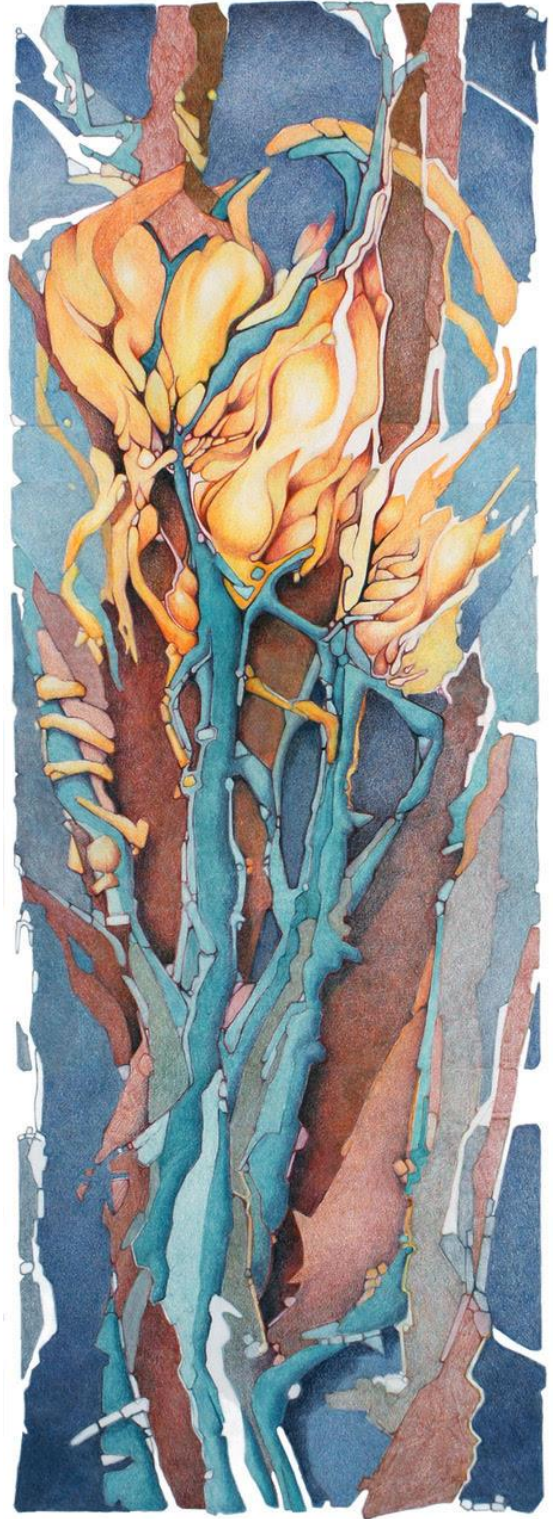
New Pathways, 26x10 inches, colored pencil on paper