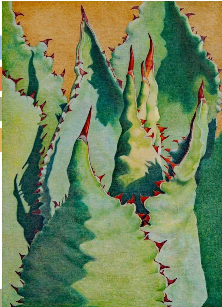
Agave Candelabra, 24x18, colored pencil on wood panel