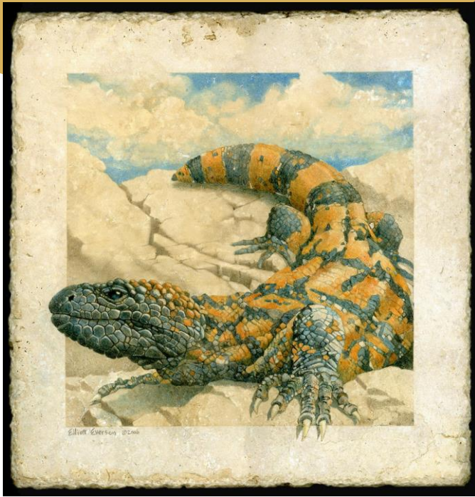
Desert Beadwork, 16x16 inches, colored pencil on stone