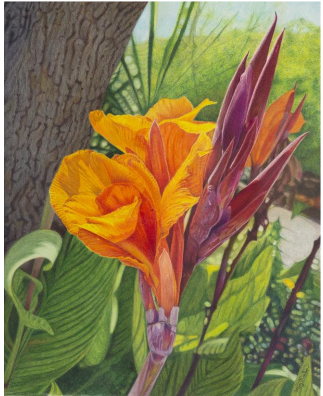
Surprise at Desert Botanical Garden, 16" x 12.75", colored pencil on Illustration Board