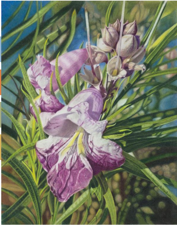
Desert Willow Delight, 11.25" x 9", colored pencil on Pastelmat