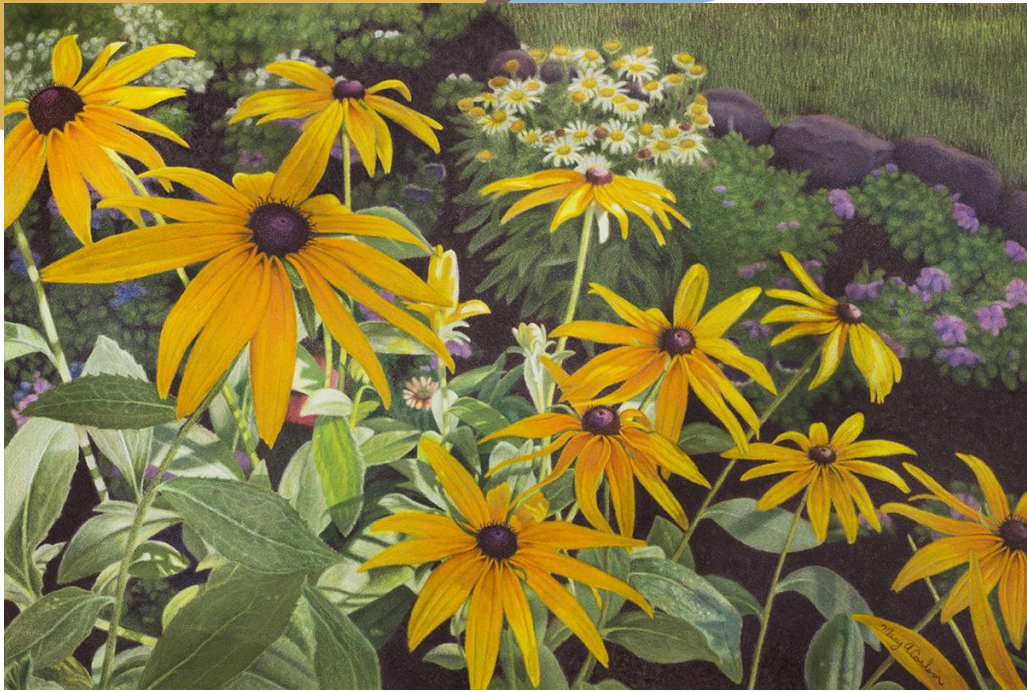
Take Me Away, 11" x 16.5", colored pencil and marker on sanded paper